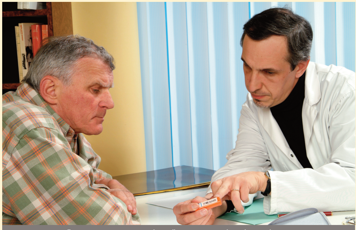
Reassurance is important when talking to patients about their medication

Ensuring an individual receives a greeting from the moment he/she enters the pharmacy can have a significant impact on forming a trusting relationship. Being able to chat to a patient in a