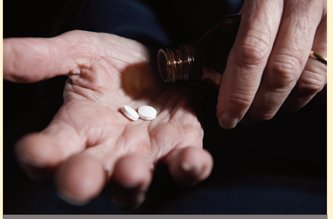
Poor adherence to antipyschotic medication is a very common problem

this issue challenging and it is great you have been able to start to address this."