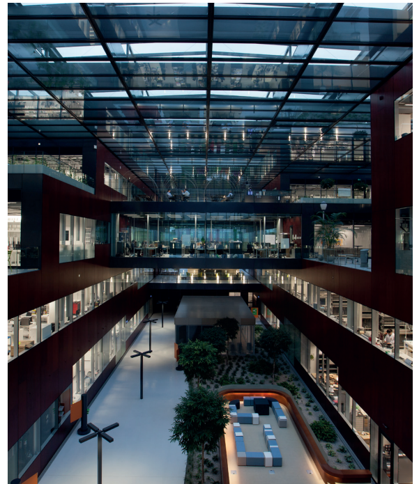
Philip Morris' R & D Headquarters today, Switzerland

The combination of PMI's scientific talent, commitment and innovation has led to the development of a novel, smoke-free tobacco heating system (THS) – commercially known as, IQOS.