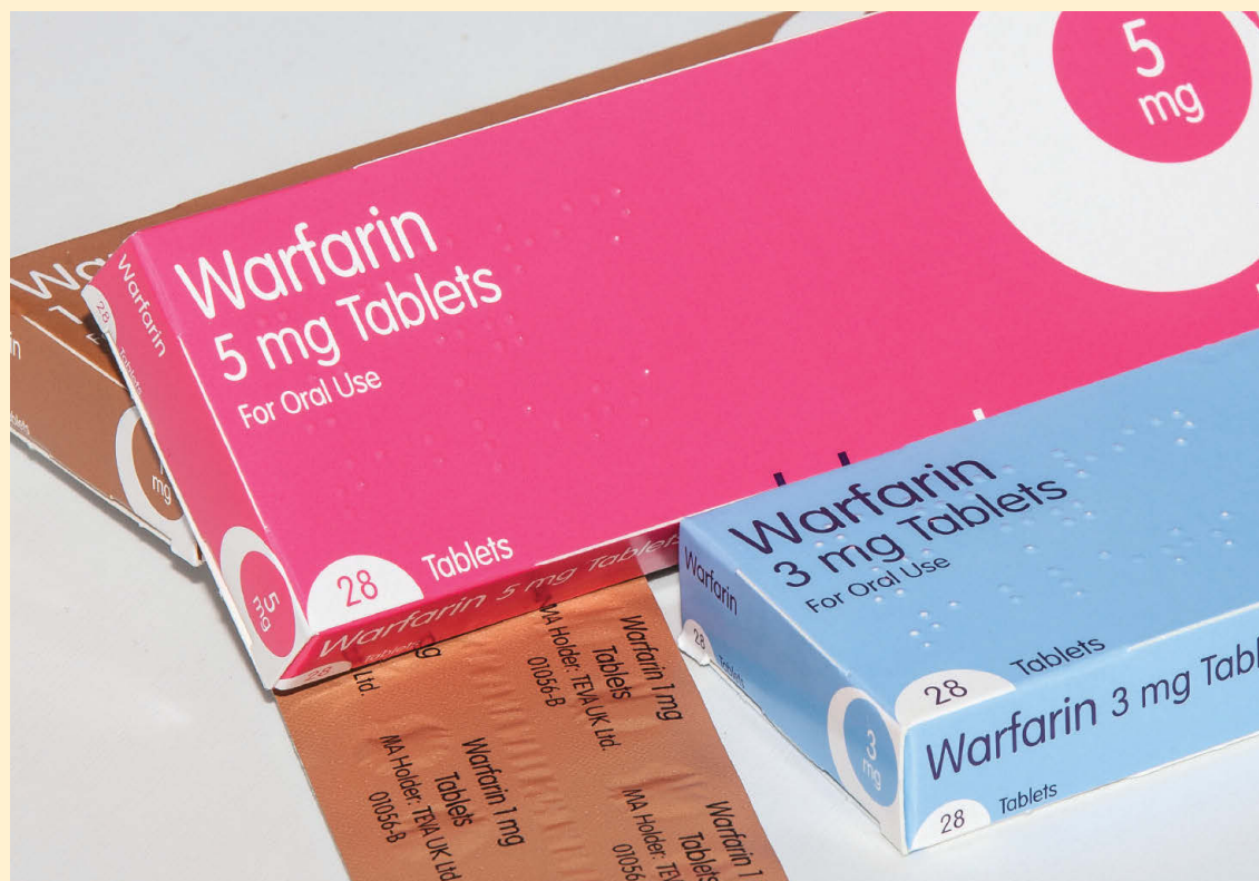
Warfarin remains the first-line treatment for ischaemic stroke and AF in most areas

How do you deal with requests for low-dose aspirin? Discuss with your team what questions they could ask to identify patients who may need to be prescribed an anticoagulant.